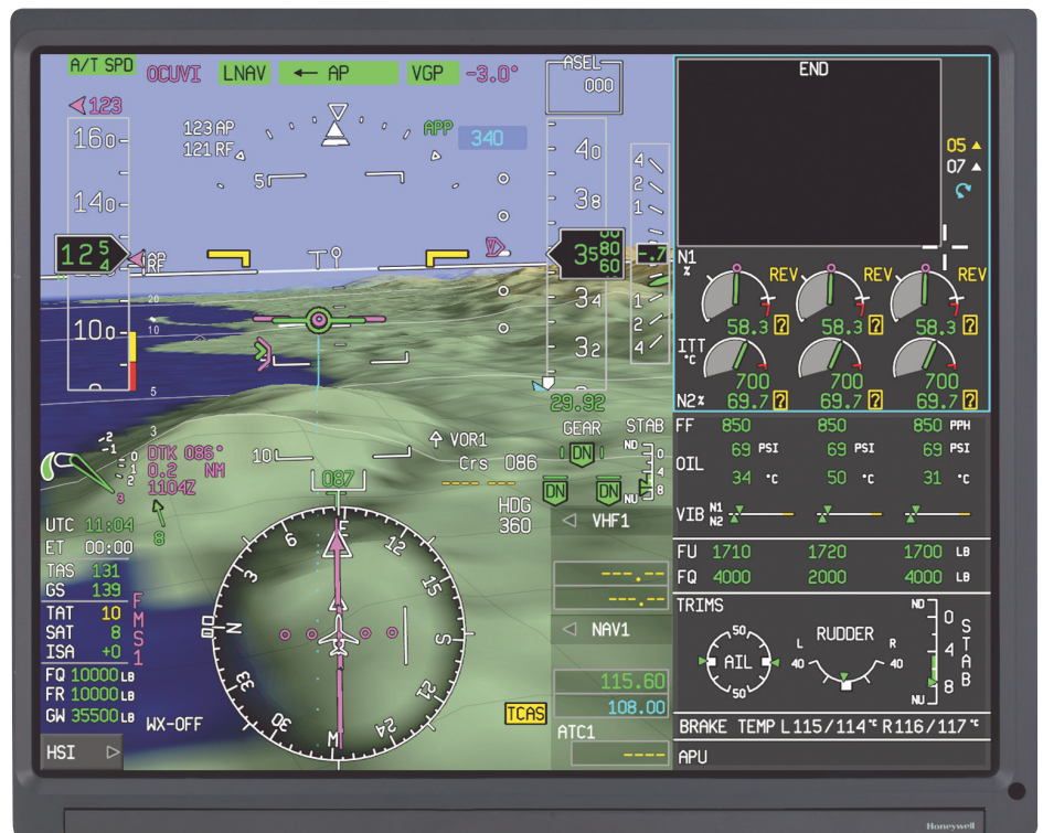
SmartView Synthetic Vision for Dassault EASy II Upgrade

SmartView also helps pilots by backing up decision links in the accident chain even further, providing a new level of safety. It is a ground proximity tool, preventing decisions leading toward Controlled Flight Into Terrain (CFIT). Because SmartView is easily interpreted, it provides the crew with an increased margin of safety that helps balance workload.