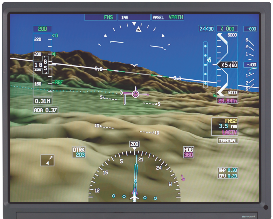
SmartView Synthetic Vision for Gulfstream Certification Foxtrot PlaneView® Upgrade